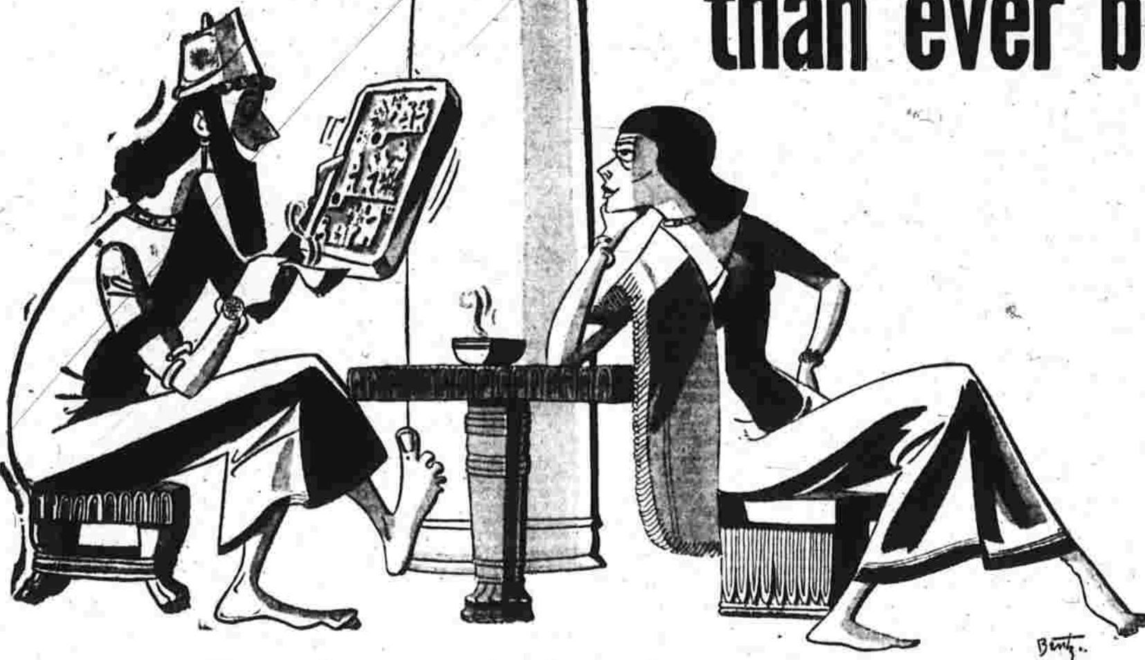
3,000 YEARS AGO the front-page news was pretty heavy, mainly because the cuneiform tablets were made of stone.