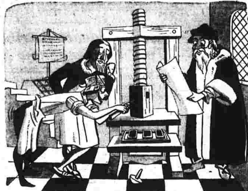
LONG BEFORE COLUMBUS SAILED, people discovered a whole new world when Gutenberg invented modern printing.