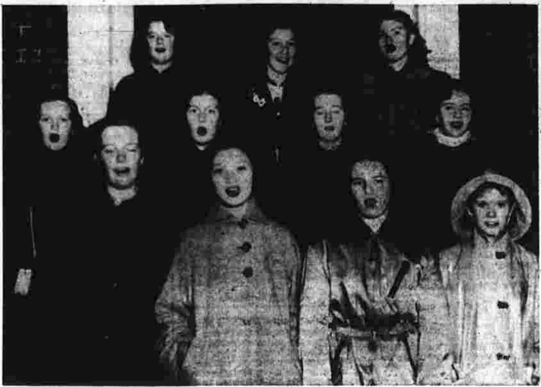
Visiting Chinese Girl Sings with Scouts On Carol Tour of Manchester Homes