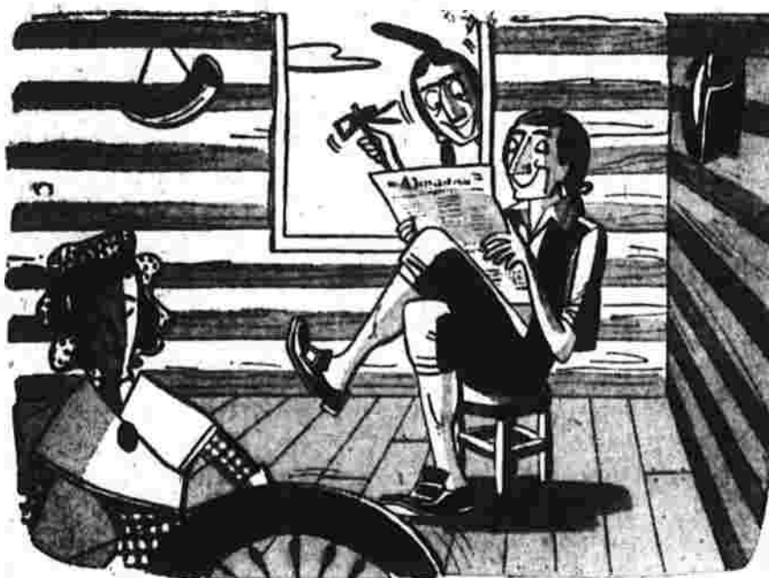
WHEN FREEDOM WAS FIGHTING for a foothold in colonial America, one of its strongest weapons was the newspaper of the day.