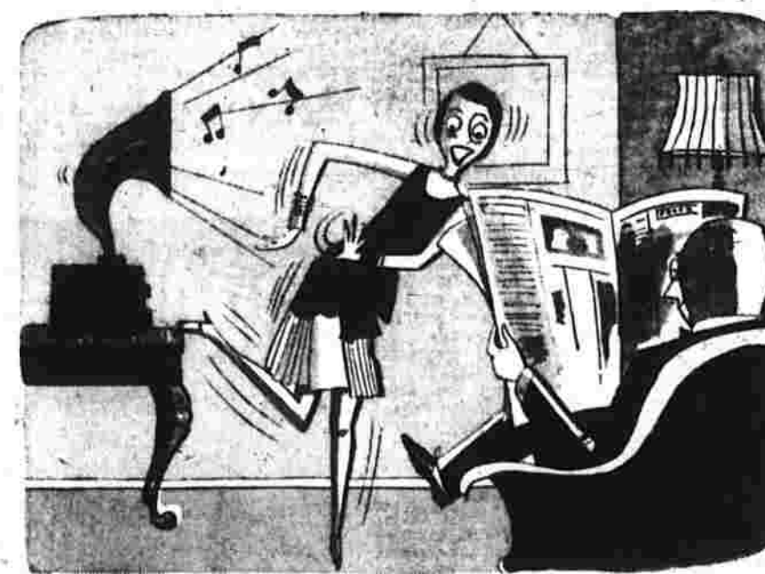
GENTLEMEN PREFERRED NEWSPAPERS in the Jazz Age — and ladies did, too! Even though infant radio squalled so lustily.