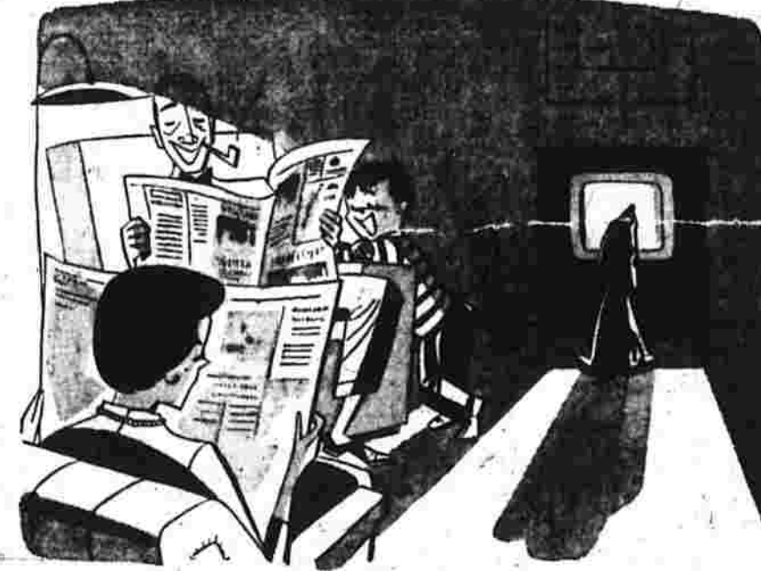
NEWEST THING on the American scene is TV, which means even more exciting things for people to read about — in newspapers.